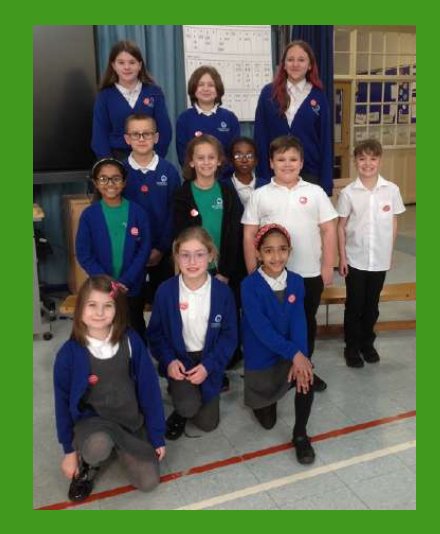
We would also like to present our new school council!

This term Year 6 has been learning about World War 2 in our history lessons. We went on an outing to the local Blitz tea room, where we could examine and discuss photographs, posters and objects from the time period.