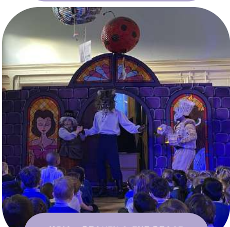
KPIA - BEAUTY & THE BEAST