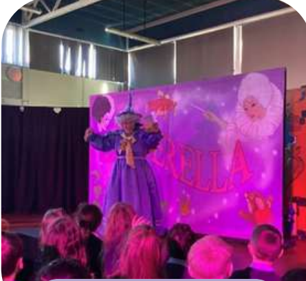
SJIS - CINDERELLA