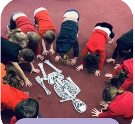
FHIS - BEE AT ONE YOGA