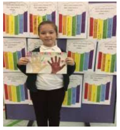
Standens Barn Primary School Flaxwell Court, Northampton. NN3 9EH